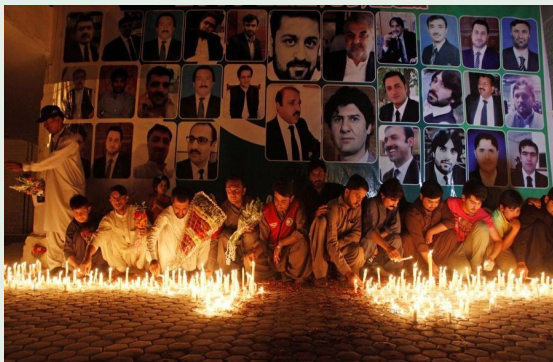
Moment of reverence after Quetta attacks on August 8th of 2016.

Then, on August 8th 2016, a bomb decimated the bar by killing 70 lawyers gathered outside the city hospital after the murder of their President a few hours earlier. In total, some 150 of Baluchistan's 280 lawyers were killed or wounded on the 8th of August in Quetta.