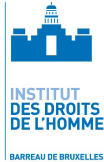
Institut des droits de l'homme du barreau de Bruxelles