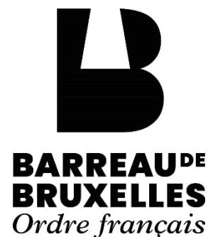
Ordre français des avocats du barreau de Bruxelles