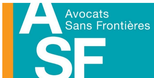
Avocats sans Frontières (Belgique)