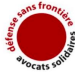
Avocats solidaires – Défense sans frontières