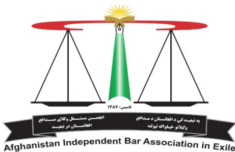
Afghanistan Independent Bar Association In Exile (AIBAIE)