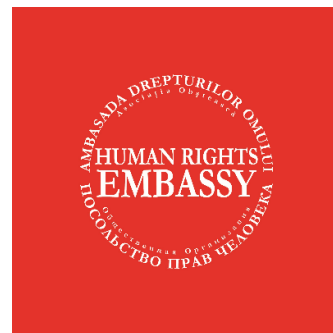
Human Rights Embassy