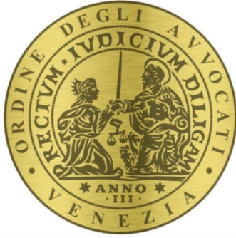
Ordine degli Avvocati di Venezia Venice Bar Association (Italy)