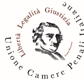
Unione delle Camere Penali Italiane Union of the Italian Criminal Chambers