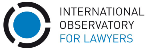
International Observatory for Lawyers in Danger (OIAD) / Observatoire International des Avocats en Danger (OIAD)