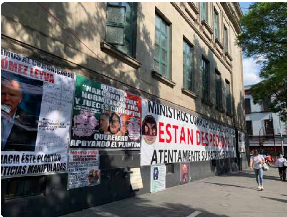
Building of the Mexican Supreme Court – Injurious direct attacks against the President of the Supreme Court, Norma Lucía Piña Hernández. Photos taken on 15 July 2023.