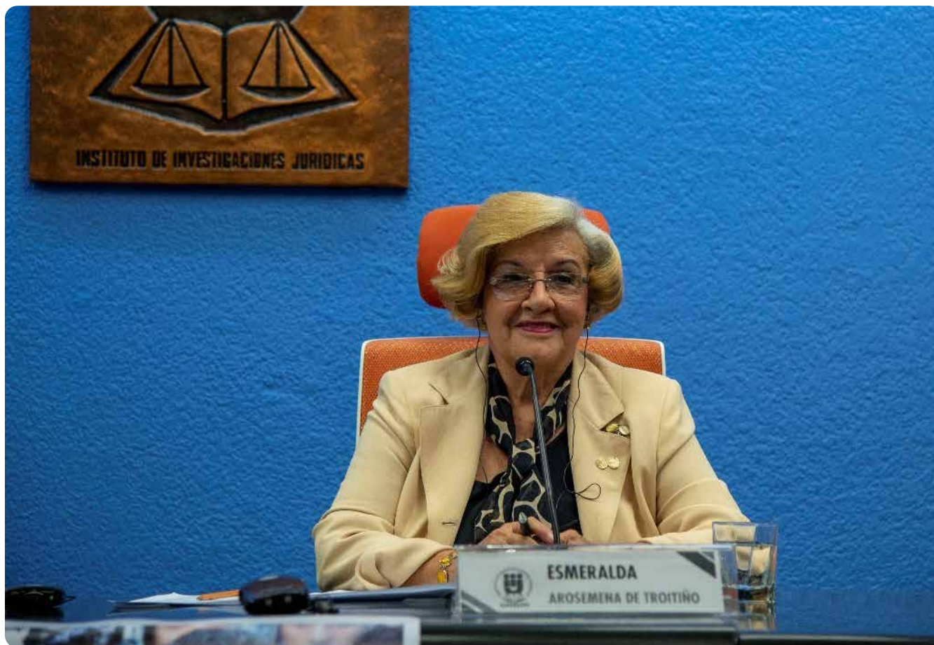
Photo: Commissioner Esmeralda Arosemena de Troitiño of the Inter-American Commission of Human Rights

Judge Manrique highlighted the need for strong institutions to effectively safeguard human rights and called for persistence in the fight against discrimination and social exclusion. The Sustainable Development Goals set forth clear objectives to be reached by 2030, and in this context, the IACtHR has a crucial role when it comes to demanding a better and more efficient administration of justice. Since the first ruling on the topic, in the Case of the Garífuna Community of Triunfo de la Cruz and its members v