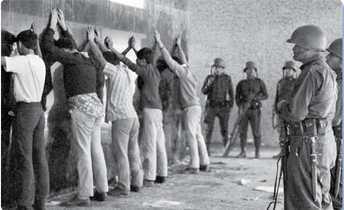
State-enforced disappearances and executions were common during the Dirty War.

Mexico suffers from a historic pattern of state-sponsored violence. Thousands of people were killed or disappeared during the 1970's internal conflict known as the Guerra sucia ('Dirty War'), in which government forces carried out enforced disappearances, systemic torture and extrajudicial executions against those perceived as political opponents. The fate of many who disappeared during the conflict remains unknown.