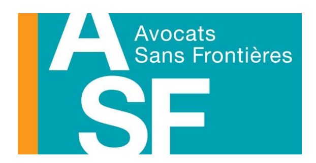
Avocats sans frontières

International Observatory for Lawyers in Danger (OIAD)