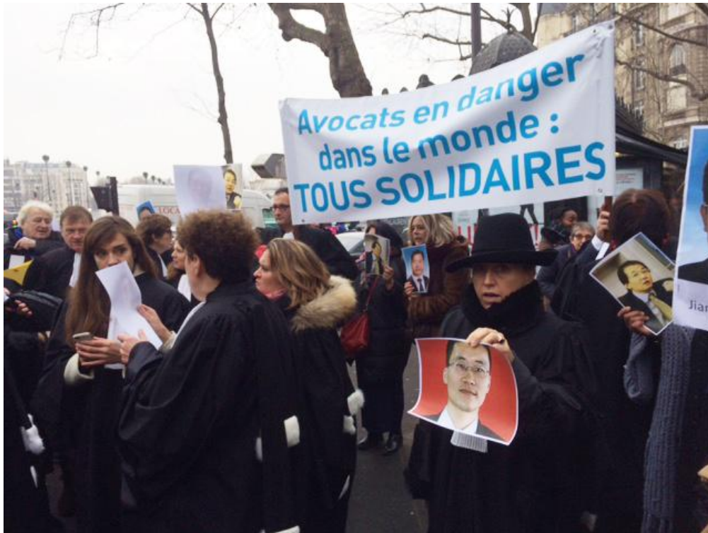
Germany / Berlin (ELDH-IADL)