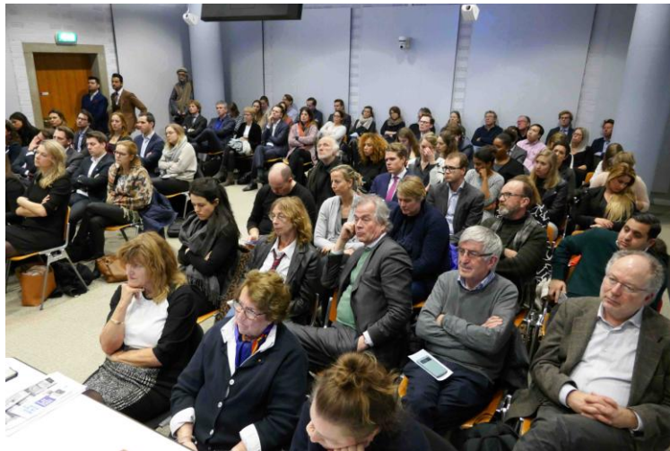
Spain / Barcelona (Catalunya)